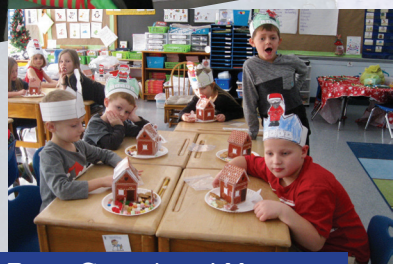
Paper Gingerbread Houses