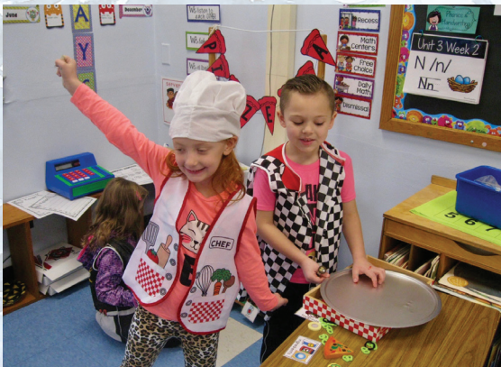
Kindergarten Dramatic Play