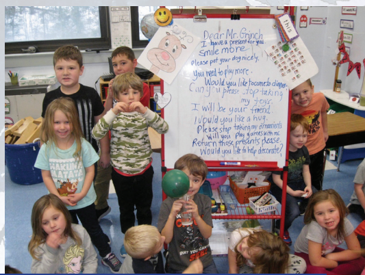
Making Grinch's Heart Grow