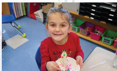
Edible Snow Trees