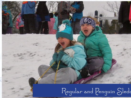
Regular and Penguin Sledding