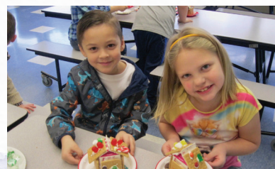
Candy Gingerbread Houses